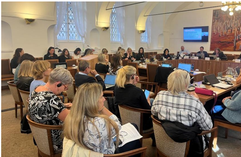
Delegates meeting to discuss welfare benefits at an event in Prague

I was also privileged enough to represent the CAB and CAS at Citizens Advice International this year in Prague alongside delegates from England, Poland, Slovakia, Romania and other countries across the globe, looking at various welfare systems across Europe.