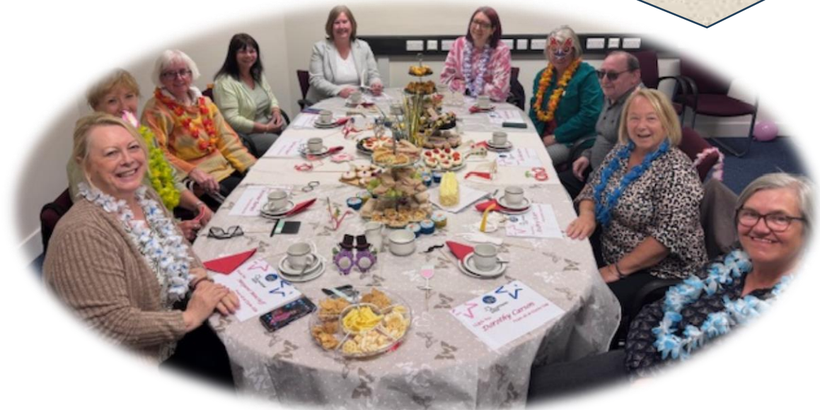
Our volunteers enjoying treats as part of Volunteers' Week 2025

I come into the Bureau for one day a week alongside working part time as I enjoy the contrast to my work and the feeling of being able to help people out with problems and often just listening as someone not involved in their personal situation, can be of help to our clients. It is also a great way of meeting people of all ages and from all walks of life. It is a good way to “give something back” and giving an awareness of the reality of the difficulty of situations that people are facing.